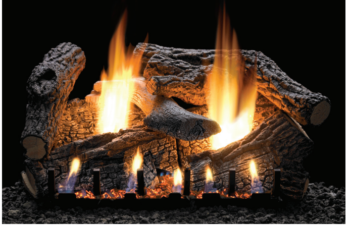
Refractory Super Sassafras Log Set (LS24RSS)