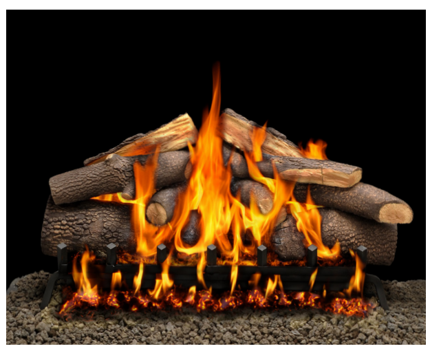
Advantage (LA) Refractory Log Set shown with Triple Burner