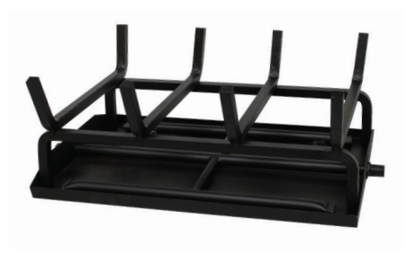
See-Through Burner (B3) (requires see-through log set)