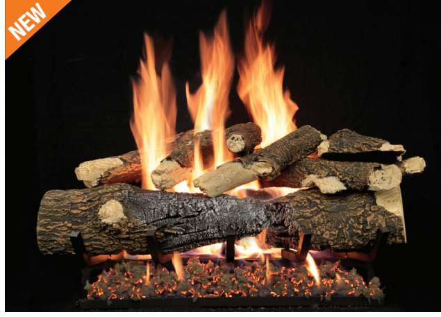
Frontier (LFR) Refractory Log Set