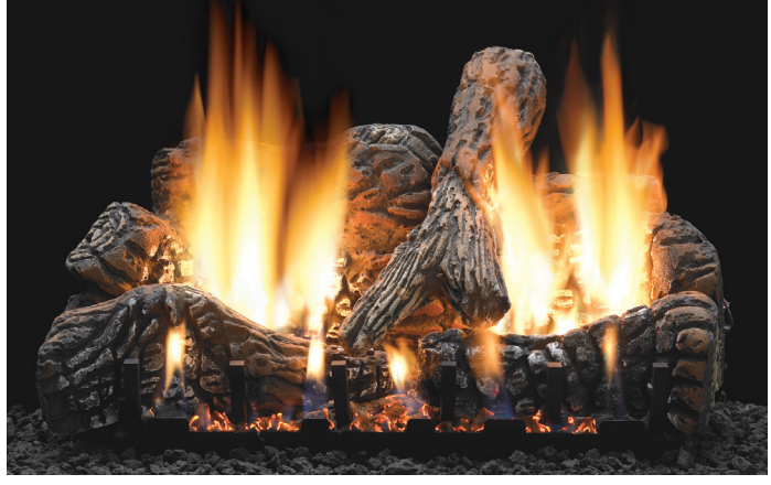
Ceramic Fiber Charred Oak Log Set (LS-24C2)