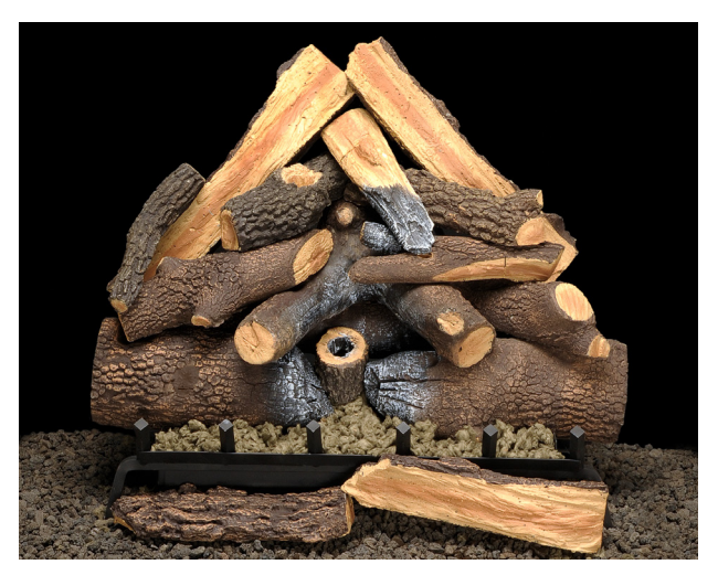
Advantage Refractory Log Set shown with Skyscraper (LAV) Accessory Refractory Logs