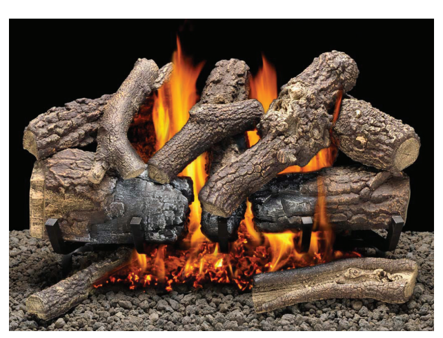
Treehouse 11 (LTH11) Refractory Log Set