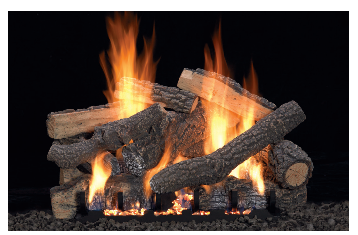
Refractory Ponderosa Log Set (LS24P)

Complete your fireplace with one of seven log sets – three styles in ceramic fiber and four in refractory concrete – each designed exclusively for the Slope Glaze Burner.