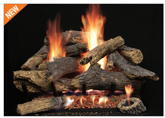
Pioneer (LPR) Refractory Log Set