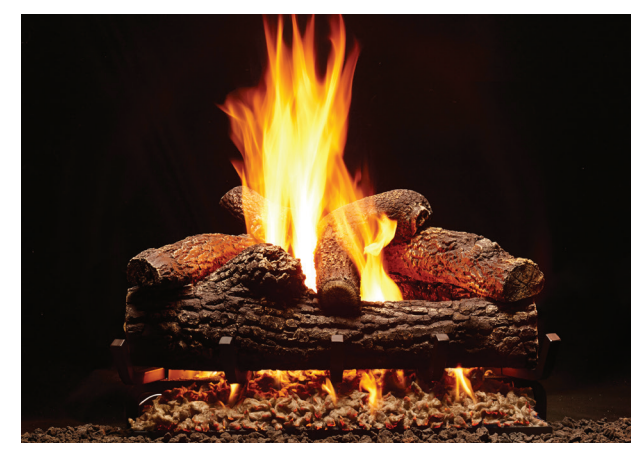
Great Lakes Oak (GLO) Refractory Log Set