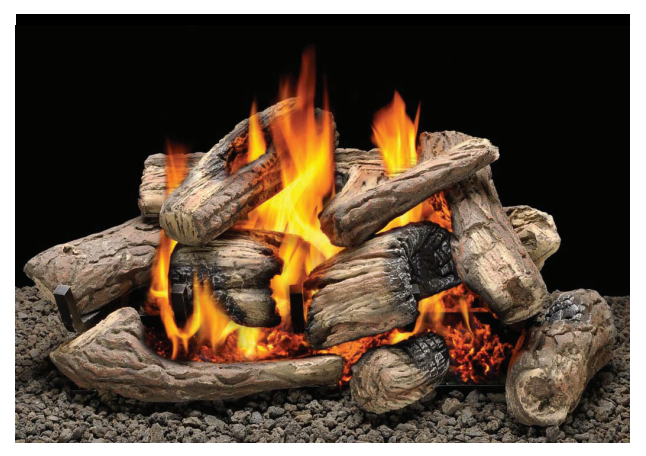
Kensington Forest (LKF) Ceramic Fiber Log Set