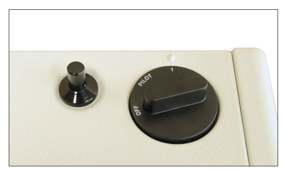
Manual Control SR6W, SR10W, SR18W, SR30W