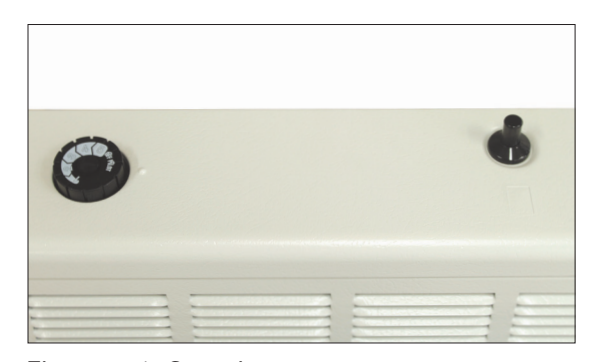
Thermostatic Control SRIOW, SRI8TW, SR30TW, BF10W, BF20W, BF30W