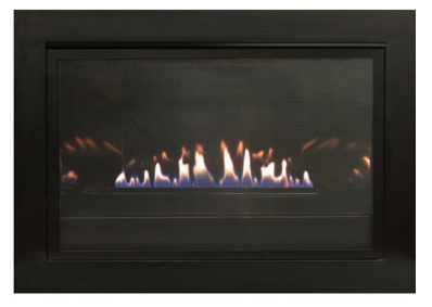
3 x 3-inch Metal Surround shown with 28,000 BTUs Vent-Free Loft