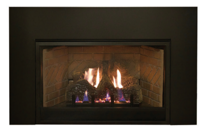
6 x 7-inch Metal Surround shown with 20,000 BTUs Vent-Free Innsbrook