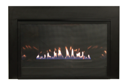
3 x 4-inch Metal Surround shown with 28,000 Btu Vent-Free Loft