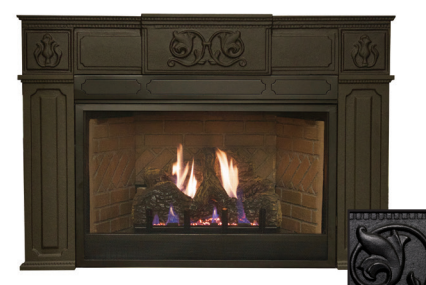
Cast Iron Surround shown with 20,000 Btu Vent-Free Innsbrook

To cover larger hearth openings, install the optional shroud. At 48 inches wide and just under 38 inches tall, it provides a clean transition between the surround and the existing fireplace.