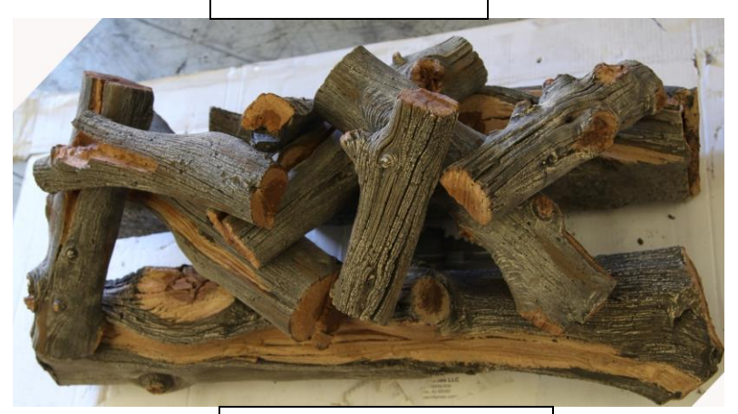
18" ARIZONA WEATHERED