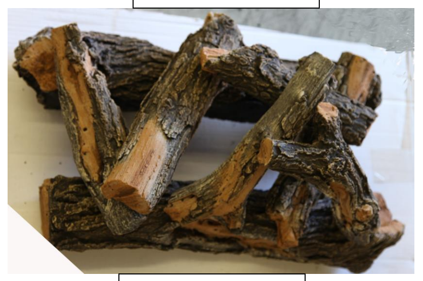
24" ARIZONA WEATHERED