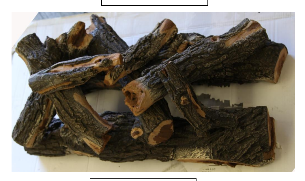
36" ARIZONA WEATHERED