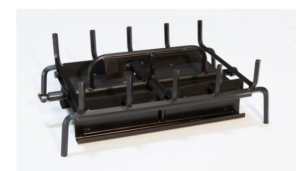
Grand Canyon 3 Burner See Through