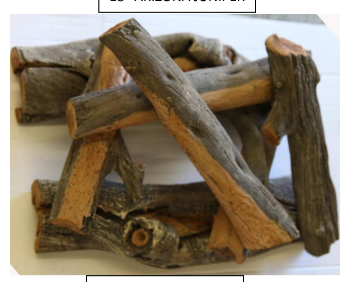
24" ARIZONA JUNIPER