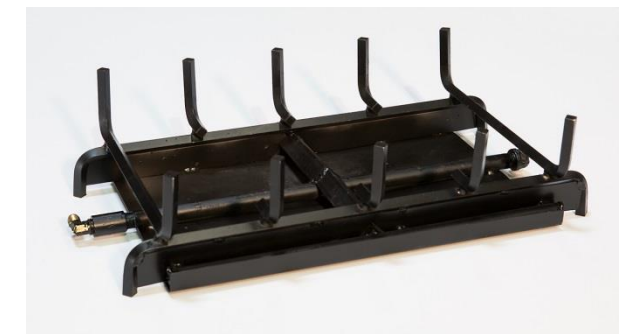
Grand Canyon 2 Burner See Through