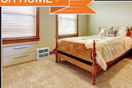
New Slimline Space Saving Heater