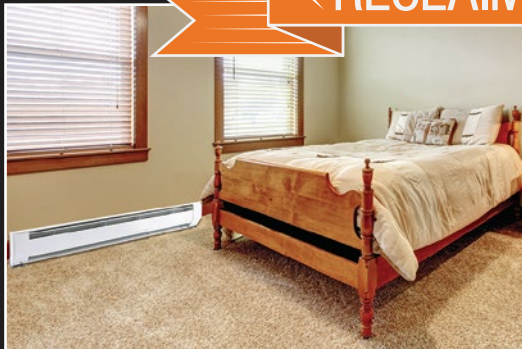
Standard Baseboard Heater