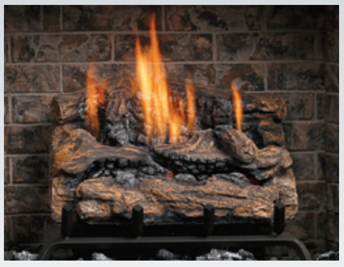
LOGF18 LOG SET Gas Burner – GLVF24MAN