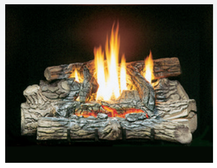
LOGF30 LOG SET Gas Burner – GLVF24MVN