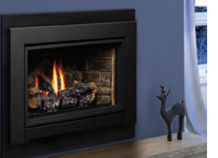
Model IDV34LP Direct Vent Fireplace Insert (Propane), I34CV1BL Clean View with I34SPF4131BL Picture Frame Surround (Black), LOGF35 Split Fibre Oak Log Set, IDV33RL Brick Liner.

Model IDV34N Direct Vent Insert (Natural Gas), I34CV1BL Clean View Kit (Black), I34S3927BL Surround (Black), RSP10 Glass Support Platform with Bronze Ember Glass, IDV33PRL Porcelain Reflective Liner.