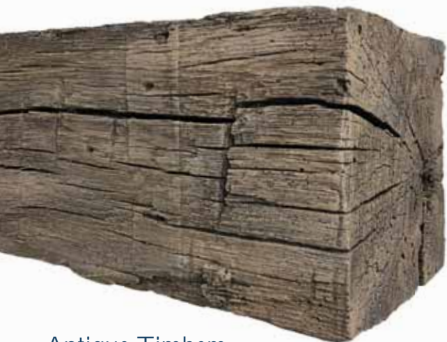
Antique Timbers, Without the Splinters

THE BEAUTY OF NATURAL MATERIALS IN NON-COMBUSTIBLE MANTELS