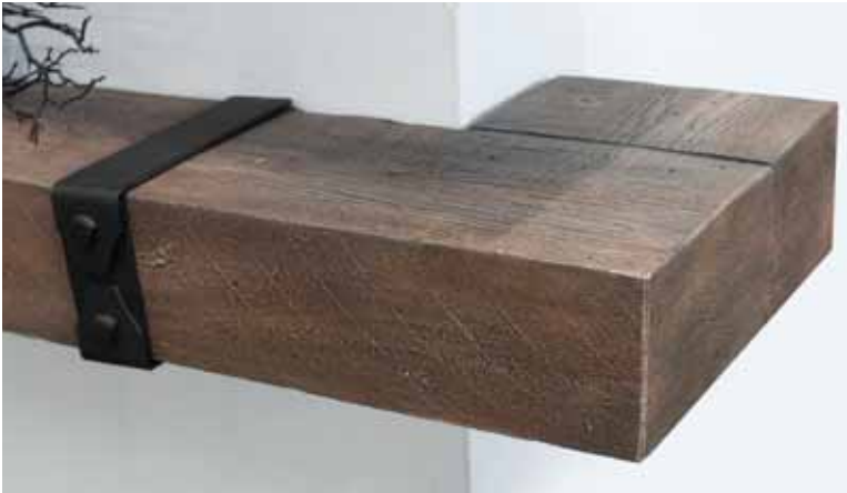
PICTURED: FLAT SAWN CORNER MANTEL (MADURO) WITH A MATTE BLACK DECORATIVE METAL BRACKET.