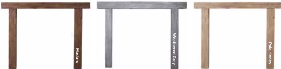
HITCHING POST | ROUGH SAWN AVAILABLE IN ONE SIZE CEDAR POST SUPPORT HEIGHT IS CUSTOMIZABLE