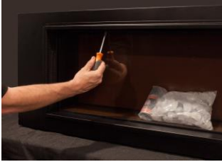
Locate screws holding in the glass and remove