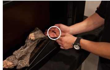
After you locating the wires inside the fireplace and the end of the driftwood logs. Plug in wires to each other.