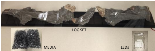
Open the Driftwood Log Set and locate the following: Log set, Smoked Glacier Crystals, LED bulbs