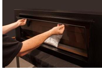
Carefully remove glass panel by pulling on the tabs located on the left and right side of the firebox lean the glass towards you and lift glass out. Make sure not to drag glass as alignment pegs on bottom may damage module finish.