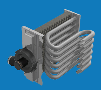
MODINE CONSERVICORE® <u>HEAT</u> EXCHANGER