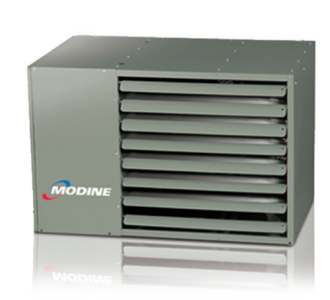
POWER VENTED HD, HDB, PDP, BDP, PTP, BTP