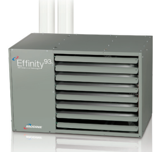
HIGH-EFFICIENCY SEPARATED COMBUSTION PTC, BTC