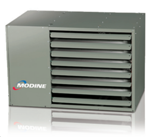
SEPARATED COMBUSTION HDS, HDC, PTS, BTS