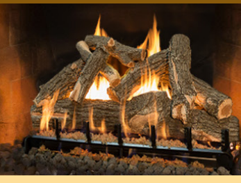
3-Burner Gas Log 36"/42"