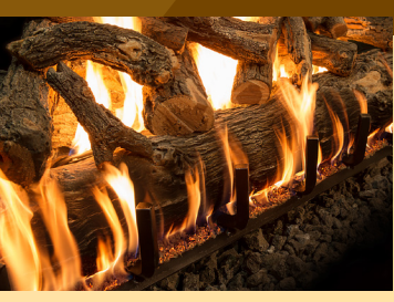
3-Burner See Through Gas Log 30"/36" (This is the view for both sides.)