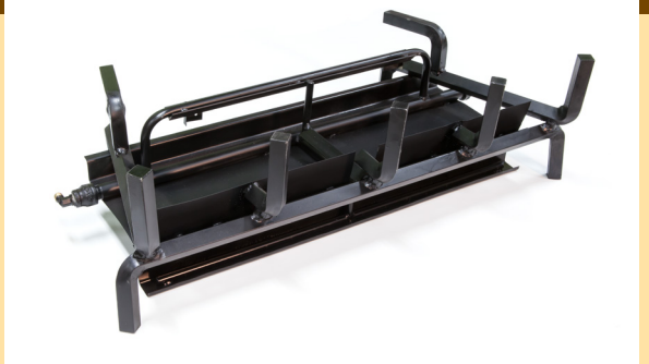
3-Burner See Through 30"/36"