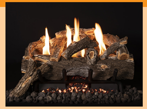
Gas Log 24"