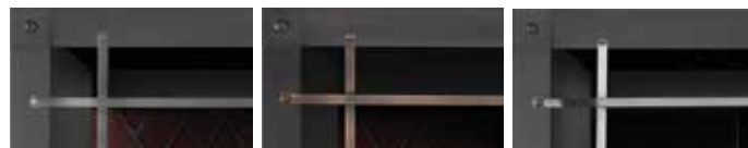
Straight Iron Element: Antique Pewter, Burnished Brass, Satin Nickel