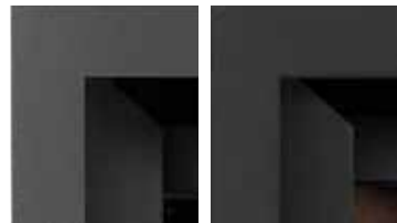
Black, Charcoal, Gun Metal, Black