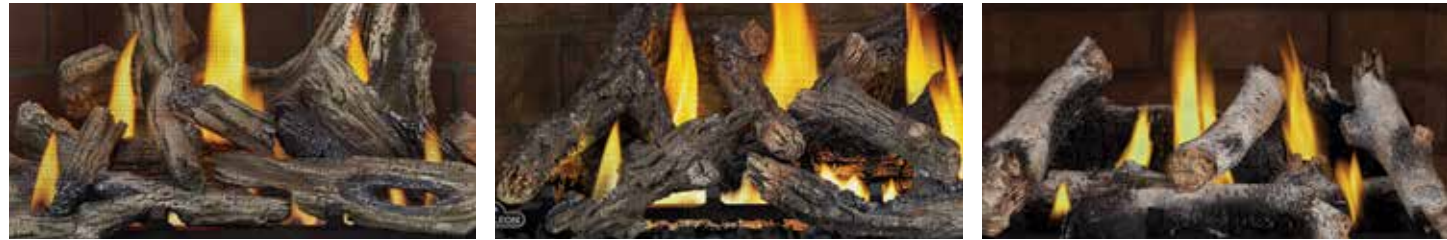
Choose One: Driftwood Logs, Oak Logs, Birch Logs