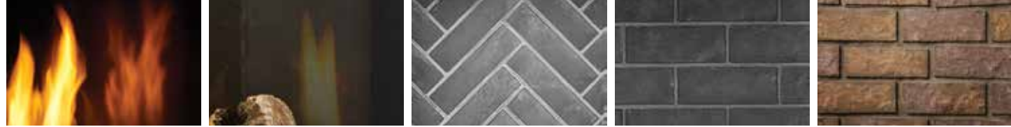
MIRRO-FLAME™ Porcelain Reflective Radiant Panels