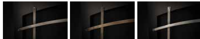
Arched Iron Element: Antique Pewter, Burnished Brass, Satin Nickel