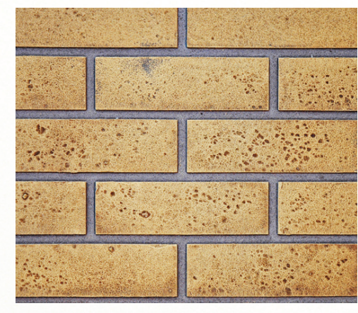
Decorative Sandstone Brick Panels *only available with the log burner