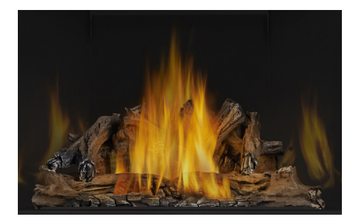
New Logset Design Creates a beautiful flame pattern and log glow