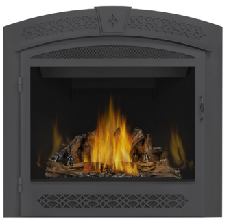
Faceplate with Operable Screen