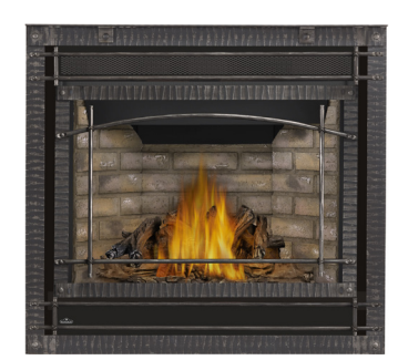
Scalloped Wrought Iron Front