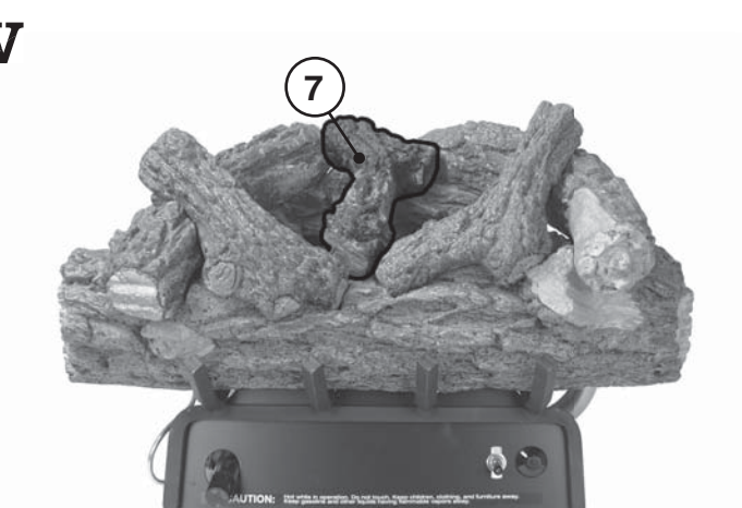
Place the <u>center top log</u> (log #7) as shown. The log should lock in place over the logs below.

Place the \underline{\text{right top log}} (log #6) as shown. The log should lock in place over the logs below.