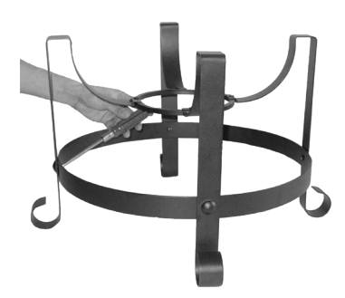
2. Align the holes of Large Ring (D) with the holes on the side of each leg and loosely attach using Bolt (F). Once stand assembly is complete, securely tighten all bolts.