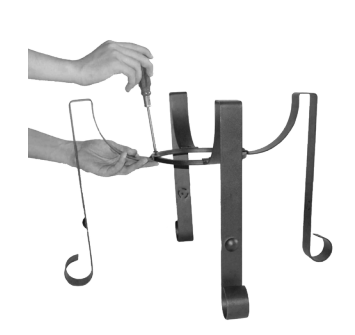
Align the holes of Small Ring (E) with the holes of each Leg (C), as shown. Loosely attach the ring to the legs using Bolt (F).