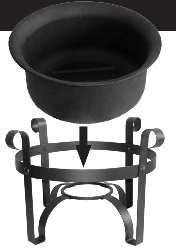
Flip the assembled stand upright and place Bowl (A) on the stand.