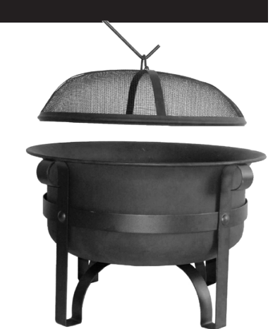
4. Place Spark Screen (B) onto the bowl.