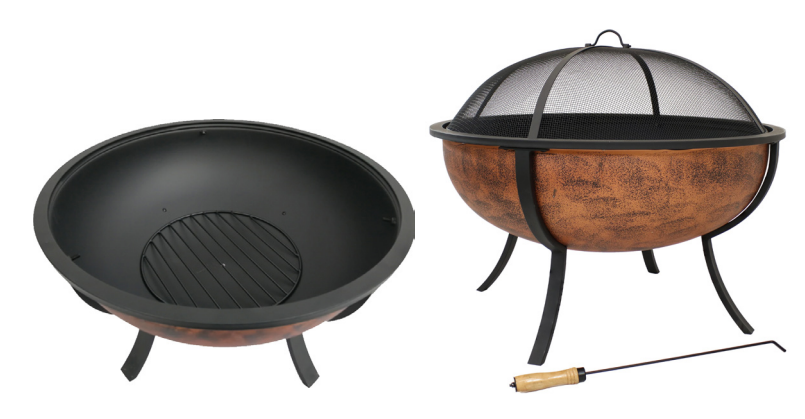
Place Log Grate (C) into Fire Bowl (A) and Spark Screen onto Fire Bowl (A).