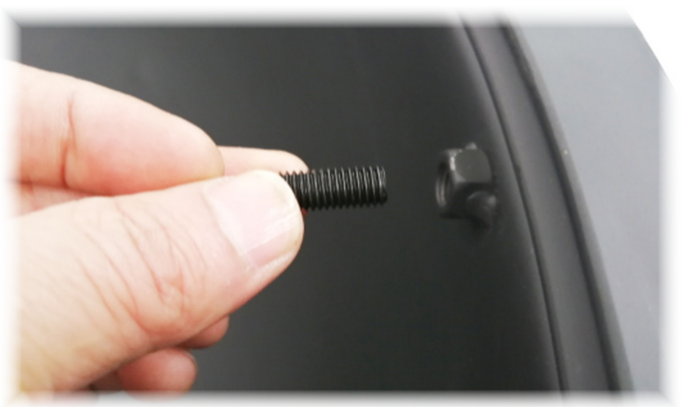
1. Hand-tighten 3x Grub Screw (G) to the inside rim of Fire Bowl (A). Hand-tighten only!