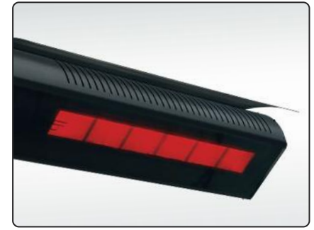
An optional Heat Shield can be installed to reduce the clearances above the heater

all the great features and benefits of SunStar's new GLASS™ radiant patio heater and how it can help to maximize your profits.