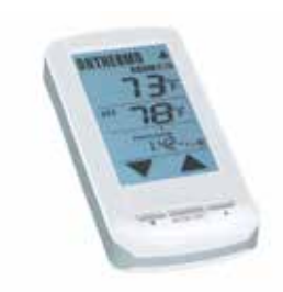
Multi-function remote control (standard with electronic ignition only)