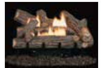
Crescent Hill HD