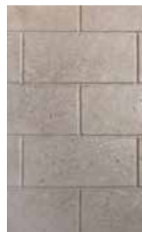
Stacked Refractory Liners