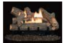
Crescent Hill HD