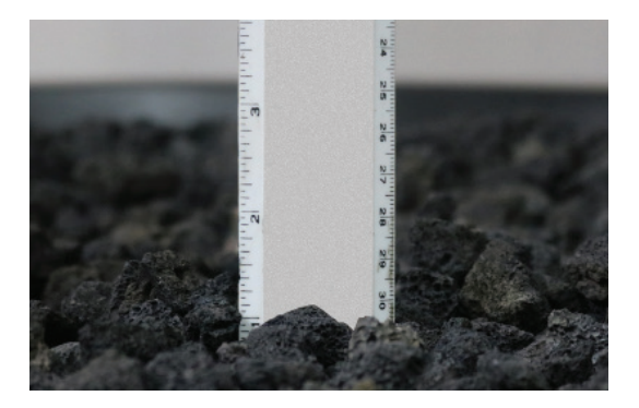
No more than 1" of burning media above the height of the burner. Adding more may cause damage