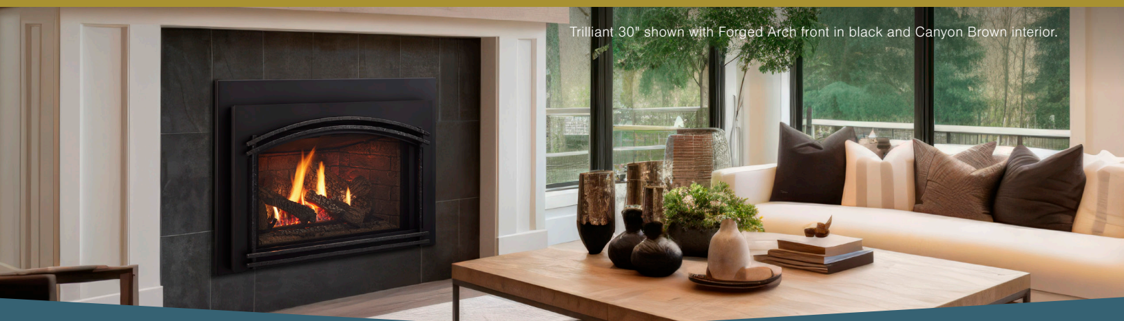
Trilliant 30" shown with Forged Arch front in black and Canyon Brown interior.