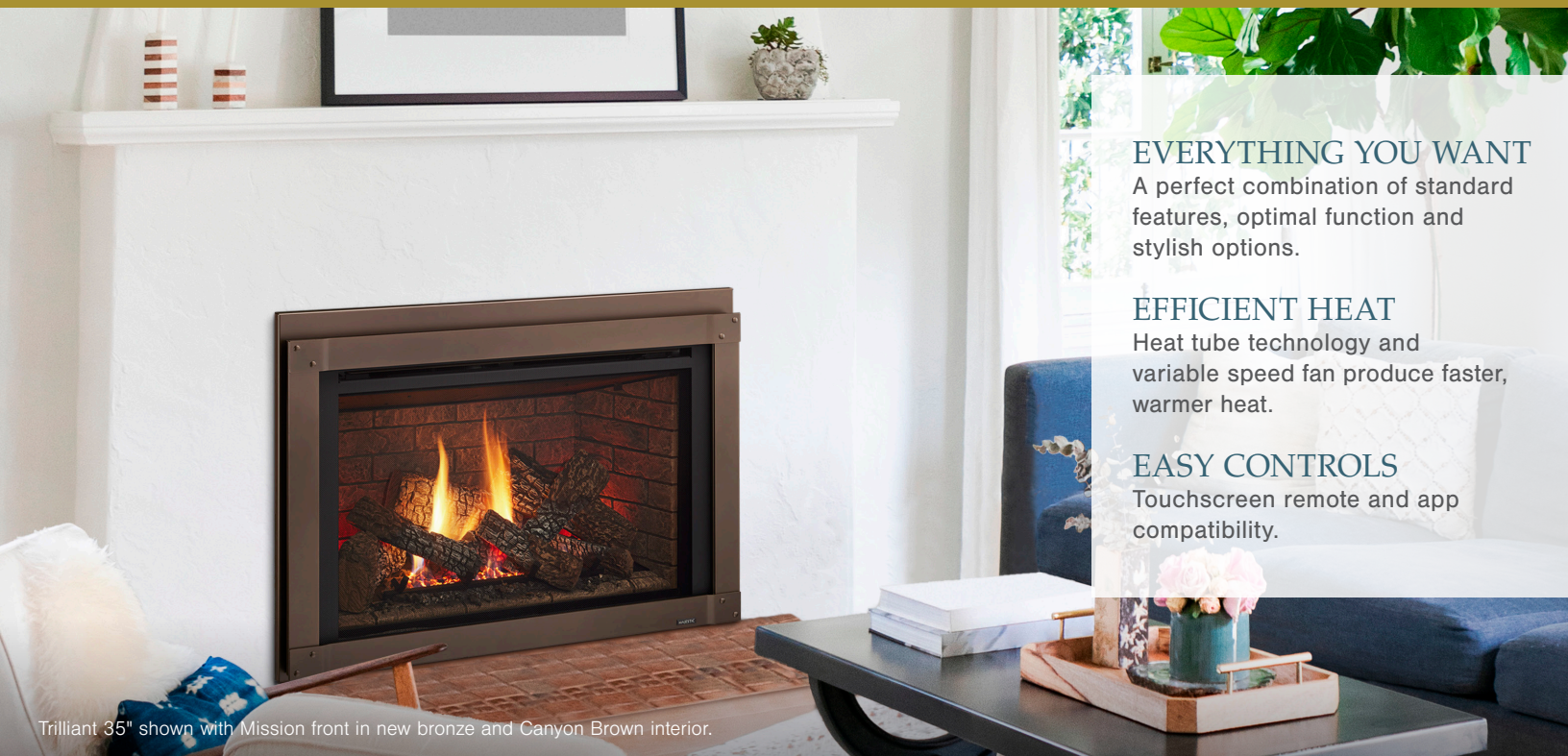
Trilliant 35" shown with Mission front in new bronze and Canyon Brown interior.